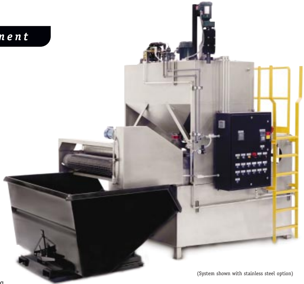
(System shown with stainless steel option)

Ringwood's wastewater treatment units optimize the use of clay based flocculants to clarify industrial wastewaters.